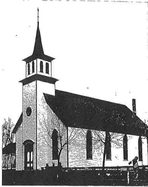
Second Church Building

The rapidly growing congregation outgrew the limited space in its first house of God. The second, larger and more appealing in appearance church building was erected in 1887 and dedicated on Palm Sunday 1888. In those days this building was a source of joy to the members and a cause of pride for the village of Springfield.